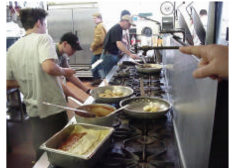
The Chefs working hard to make the 162 Banquet a success.

The 162 dish banquet will be remembered by many for years to come. I know it will live in my memory for a long time.